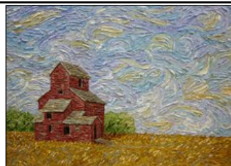
Sculpted Landscapes By Ken Dalgarno

Consider raising your membership support above the basic level, because even an extra $20 helps. All support above the minimum level is tax deductible.