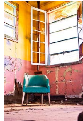
Monica Tininenko page 2