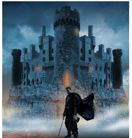
Richard III - Montana Shakespeare in the Parks page 2