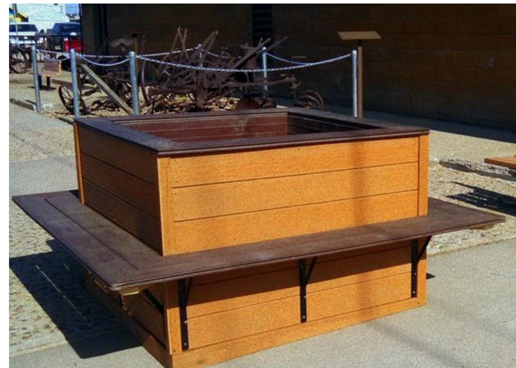
FRESH FLOWER BEDS AND SEATING OUTSIDE THE MONDAK