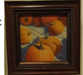
"Pumpkin Cheer" by Judith Edgington Bayes

exceptional showing. Miniature art makes great Christmas gifts for those hard to buy for people on your list.