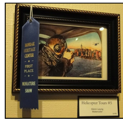
Miniature Art Show page 3