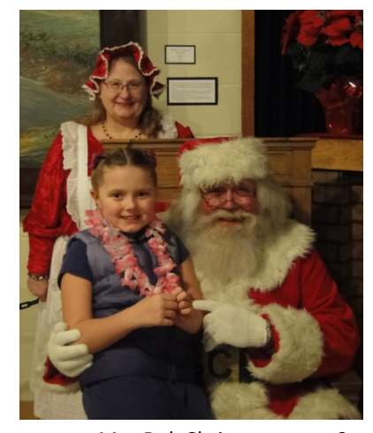
MonDak Christmas page 2