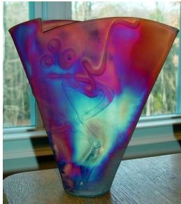
Raku Pottery Workshop page 4