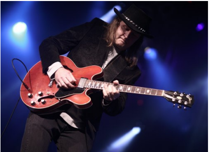
Burgers, Brews & Blues page 3