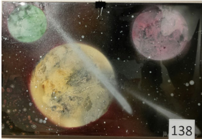
Youth Art page 2