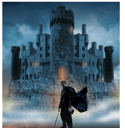
Richard III - Montana Shakespeare in the Park s page 2