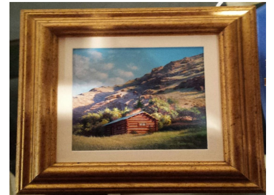
2015 1st place winner :

In years past, this show has included art from all over the United States and throughout the world. We look forward to another exceptional showing.