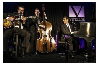
10th Annual Celebrating Chocolate entertainment by Nat King Cole Tribute Page 4