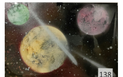
Youth Art Show Page 3