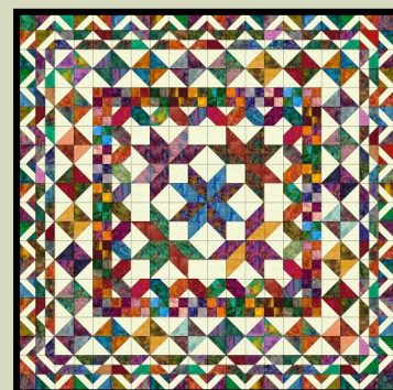
36th Annual Quilt Show—p. 10