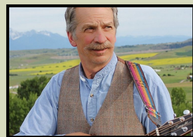
Meagher of the Sword—p. 3