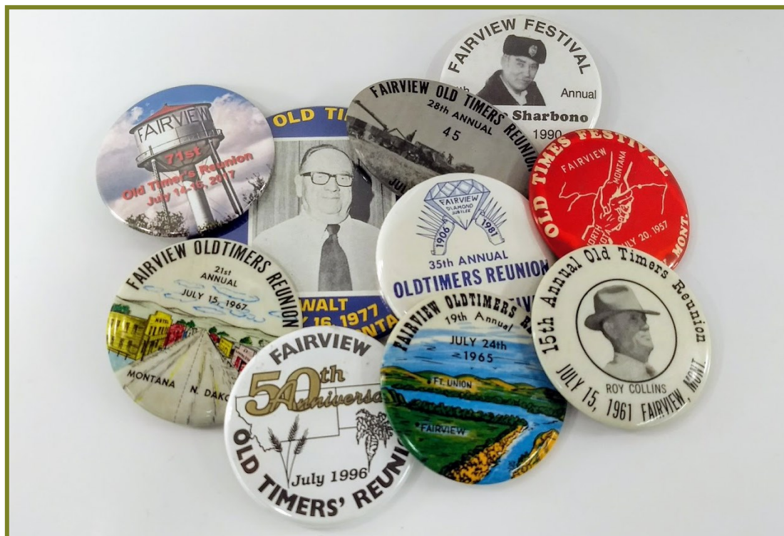
Fairview Old Timer's Reunion buttons from the MDHC Collections