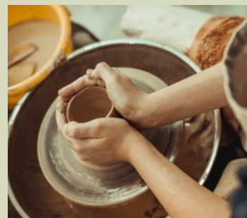
Open Studio Saturdays—p. 4