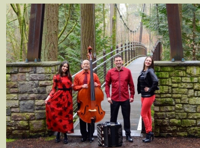
Celebrating Chocolate—p. 3