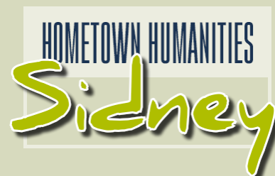
Hometown Humanities—p. 10