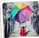
Members: $35 Not Yet Members: $45