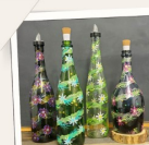
Members: $30 Not Yet Members: $40