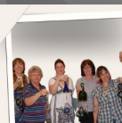
Members: $40 Not Yet Members: $50