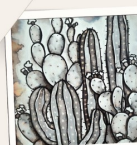
Members: $30 Not Yet Members: $40

Space is limited. Register for classes @ (406) 433-3500 or online