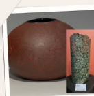
Free Demo & Artist Reception