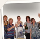
Members: $40 Not Yet Members: $50