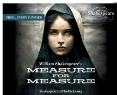
Sidney | Veterans Memorial Park July 1st | 6:30 pm

Please consider making a donation today to the MonDak Heritage Center to support MSIP programs in Sidney & help us meet our sponsorship obligation of $1755.00. Your gift directly funds the Sidney performance & helps provide fun, family-friendly activities that strengthen our local community and make it a great place to live and visit. Your generosity will be acknowledged in the performance's program and throughout the event. Thank you for your support and we look forward to seeing everyone at the performance on July 1st!